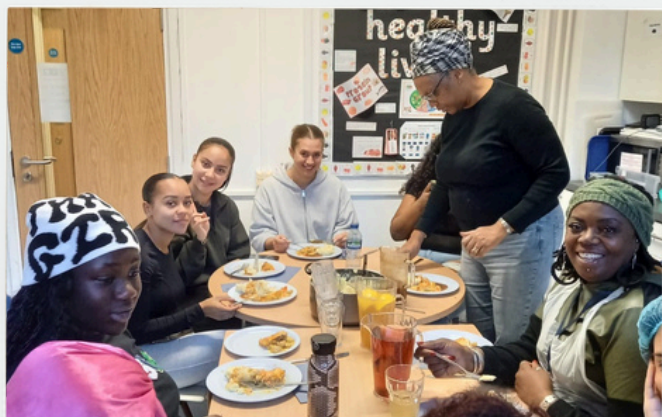
Cooking up a storm!

"You're lovely souls and are amazing individuals with very big hearts. Thank you for all your help and words of wisdom. I appreciate everything you've done for us."