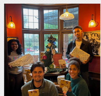
The Leather Bottle