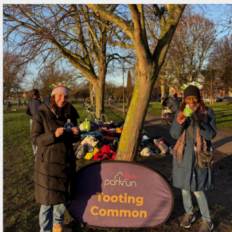
Tooting Park Run