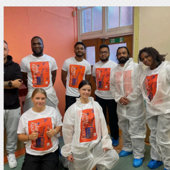
B&Q: Build a Life Project